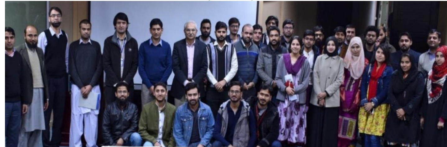
IEEE Seminar on Development of Satellite-Terminal Antennas (Dec '19)