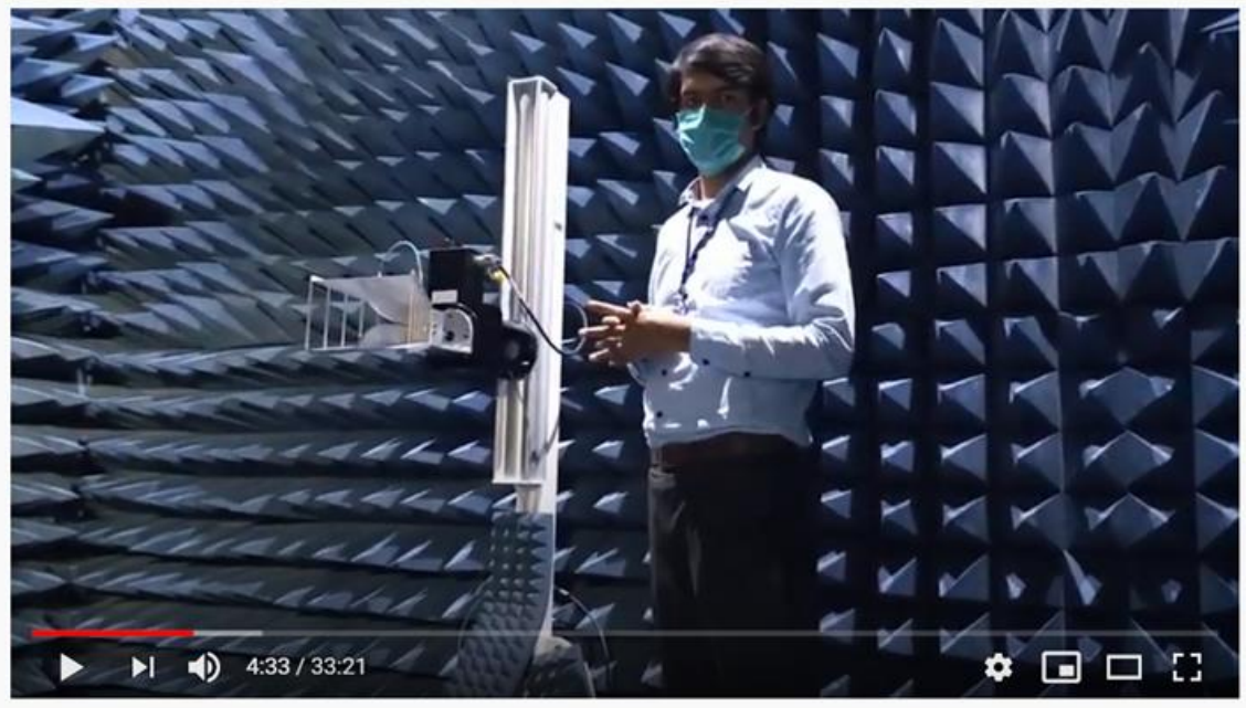
Antenna Test and Characterization using Anechoic Chamber.