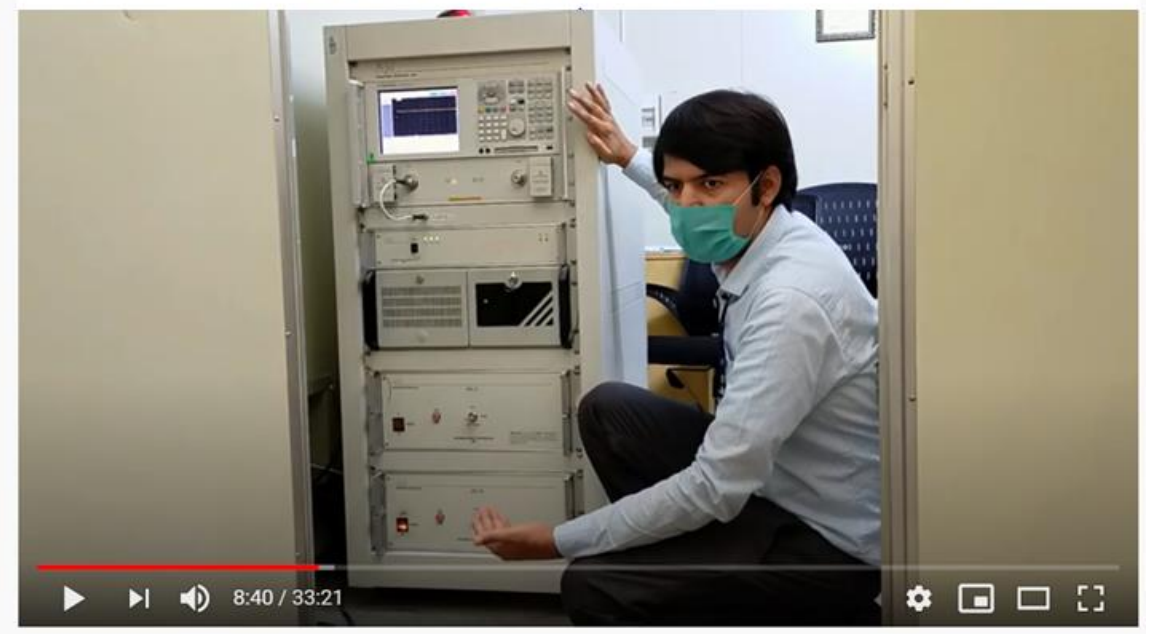
Antenna Test and Characterization using Anechoic Chamber.