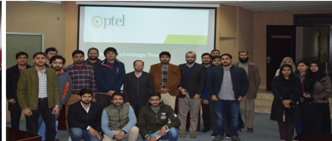
IEEE Seminar on 5G for Internet of Things (IoT) Applications (Dec '19)