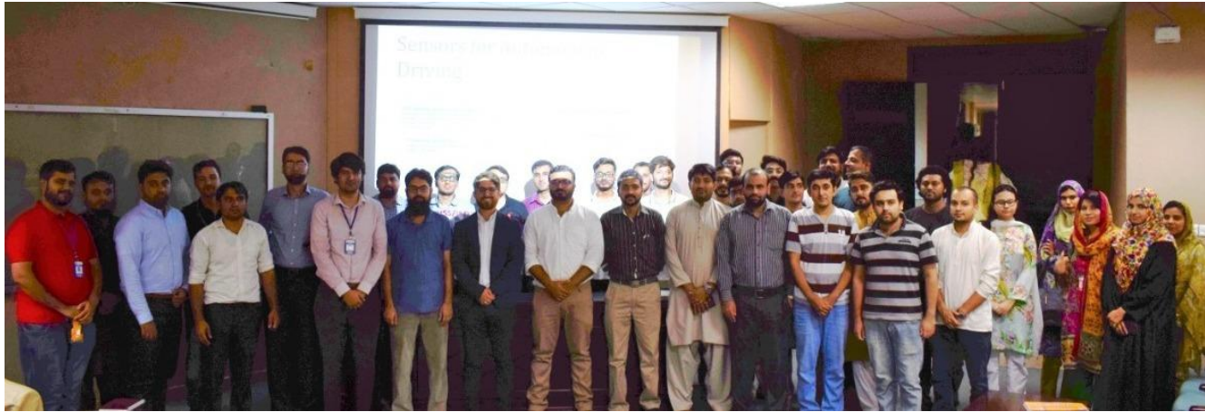
IEEE Seminar on GNSS Introduction and its Applications in Automobile Industry (Sept '19)