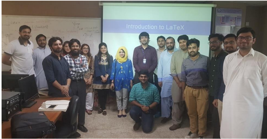
IEEE LaTeX Workshop (May '19)