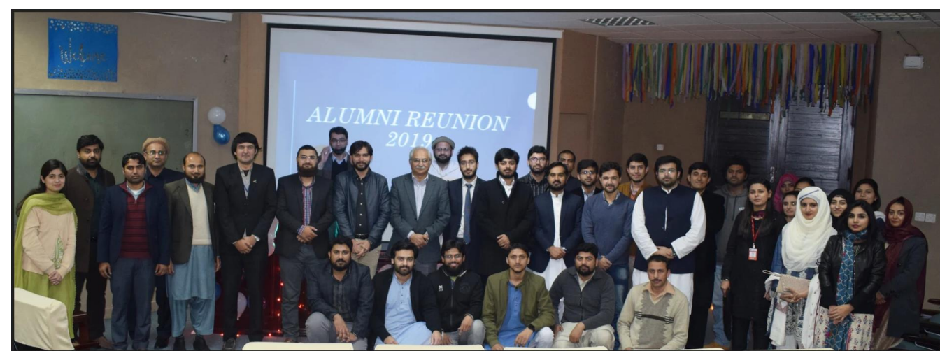
Alumni Reunion (Dec '19)