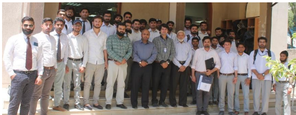
IEEE Chapter Outreach – Riphah International University (May '19)