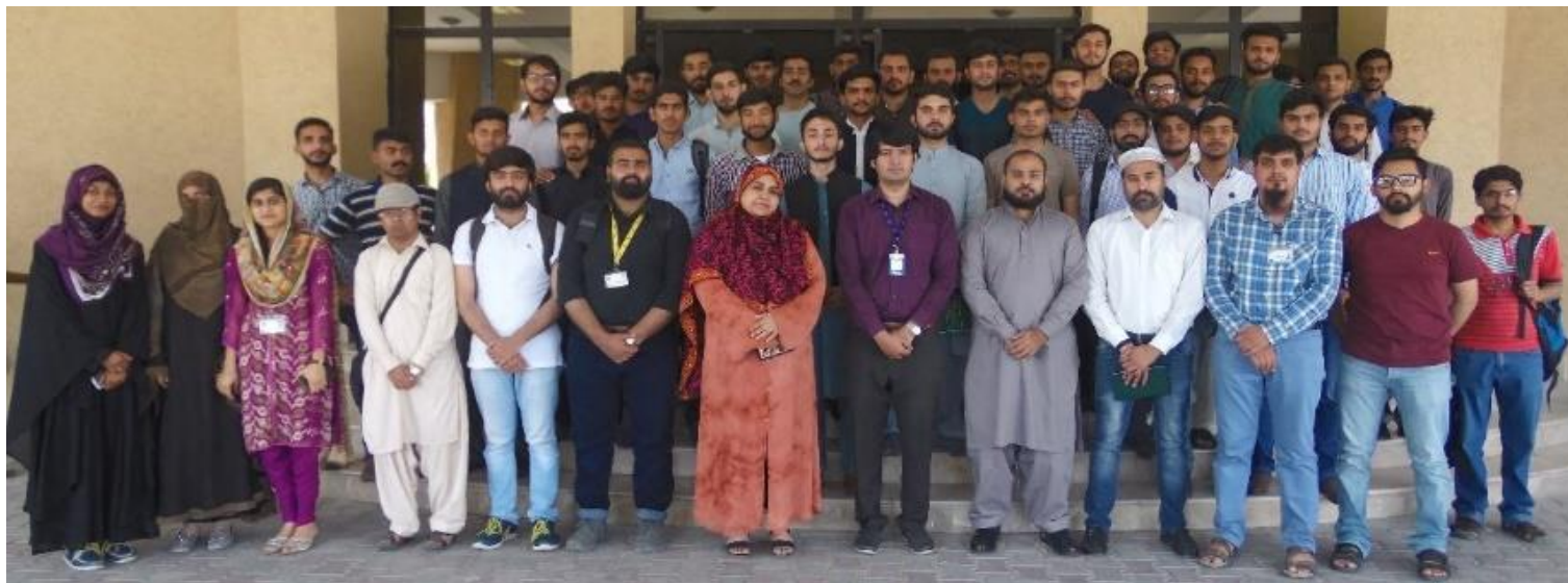
IEEE Chapter Outreach – Riphah International University (May '19)