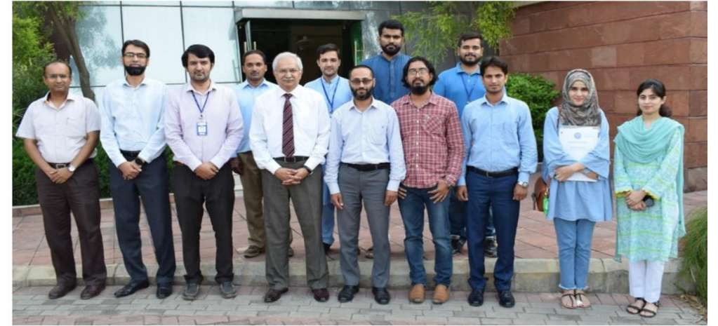
IEEE EMC/I and RF Cable Characterization Workshop (Aug '19)