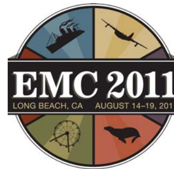
The Queen Mary - Long Beach, California