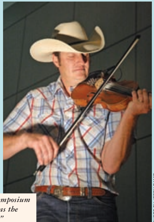
Live music was featured at the Symposium Gala since Austin is well known as the "Live Music Capital of the World."