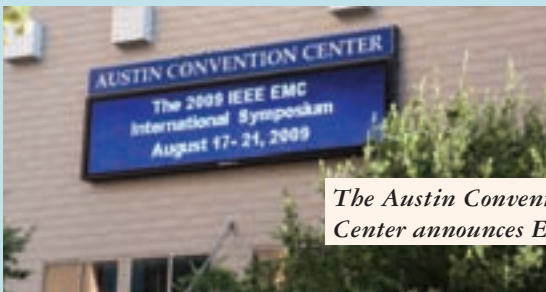
The Austin Convention Center announces EMC 2009.