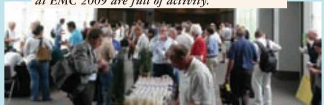
Contrary to popular belief, the Friday sessions at EMC 2009 are full of activity.